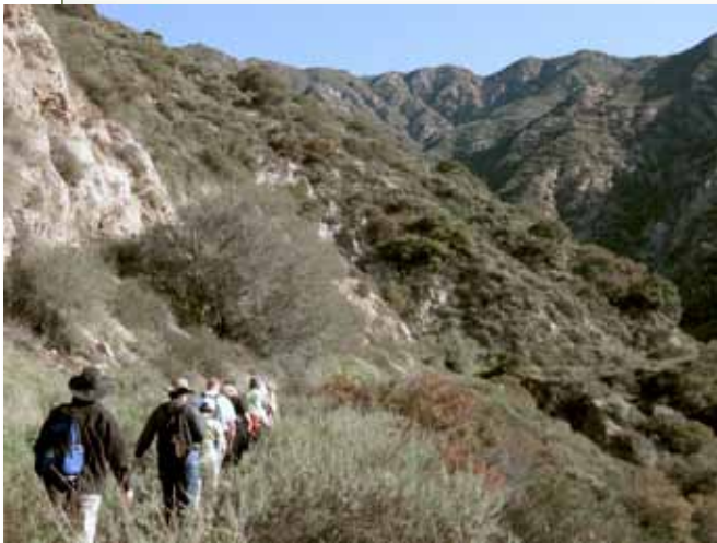
Hikers in Rubio Canyon walk along the right-of-way trail for the former Mount Lowe railway in Rubio Canyon.