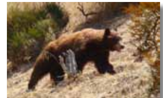
A black bear roams Rubio Canyon, near Loma Alta Drive.

Rubio Canyon provides habitat for several wildlife species, including mule deer, bobcats, grey foxes, ring-tailed cats, Cooper's hawks, western screech-owls, wrentits, canyon wrens and other